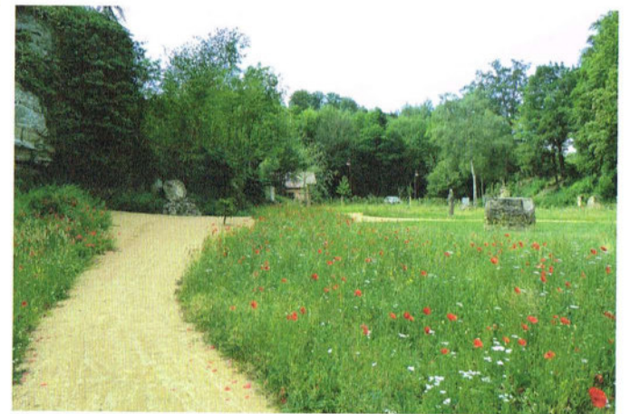
Station of the Cross illuminated at night. Way of the Cross in spring. Path leading through the site alongside the boulders. Station of the Cross detail at night. Daffodil field. Bench on rocks. Flower meadow with red poppies alongside the Way of the Cross. Site plan.